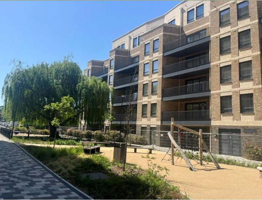
Photo (above): Showing landscaping between Blocks B and E.